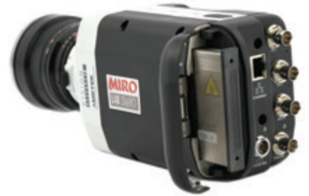
Phantom Miro LAB 3a10 showing optional CineFlash

And, PCC supports a suite of measurement tools that allows you to track points, estimate distance, velocity, acceleration and angles based on points in the cine file. These tools are in both the PCC and the Cine Viewer software packages.