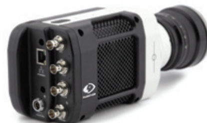
Phantom Miro LAB 3a10 - rear view