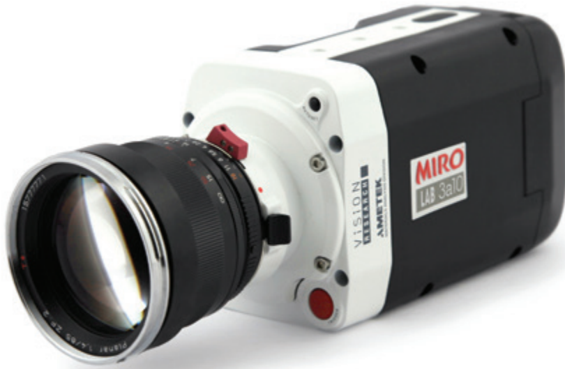
Phantom Miro LAB 3a10