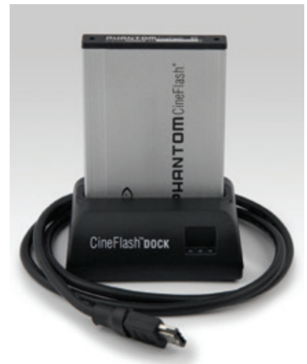
Phantom CineFlash Drive & CineFlash Dock