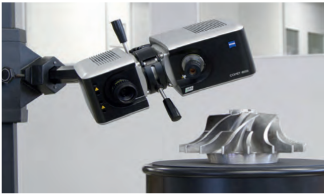
ZEISS COMET 6 provides high-end technology and achieves best results for demanding measurement applications

The high-performance software platform colin3D ensures a consistently efficient and project-oriented procedure during the entire measuring process.