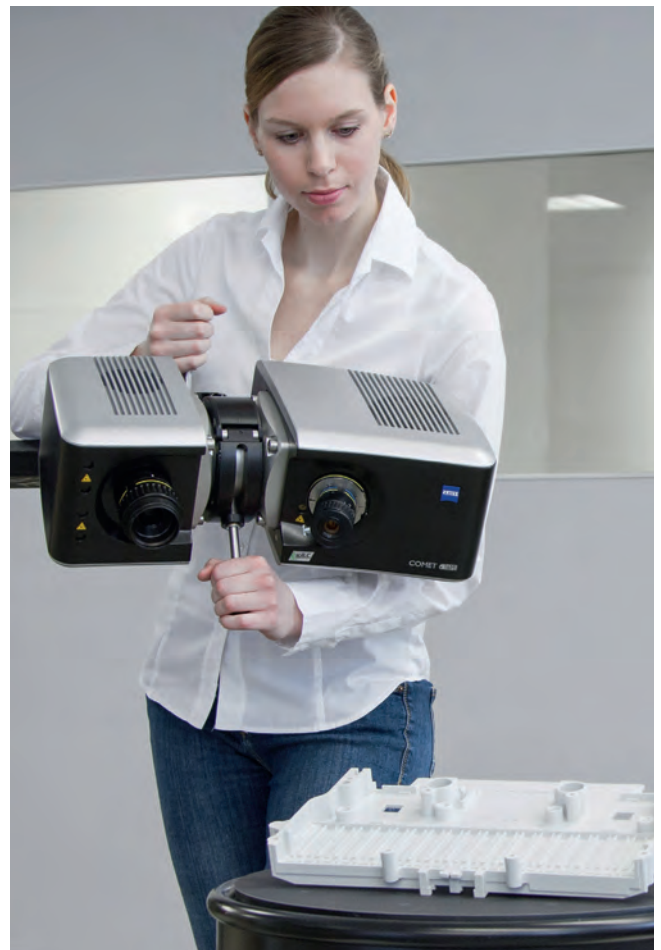
With the user-friendly handling unit, the ZEISS COMET 6 sensor can be positioned very easily and quickly

Requiring only a few simple steps, the modular digitizing system can be adapted to a different field-of-view, and is available for your next application within shortest time. Without the need of any elaborate hardware modifications or additional sensors, you can take full advantage of the exceptionally high flexibility provided by the ZEISS COMET 6 high-end sensors.