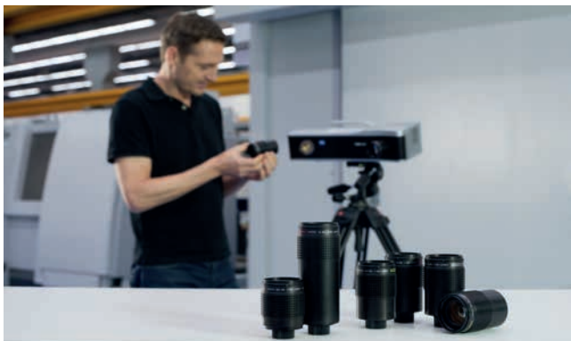
The right sensor for every application:

The high-performance software platform colin3D ensures a consistently efficient and project-oriented procedure during the entire measuring process.